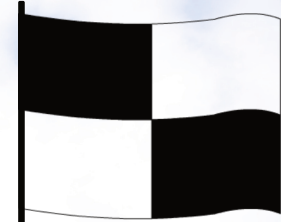
BLACK & WHITE FLAGS