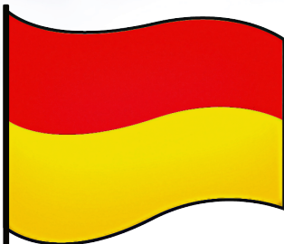
RED & YELLOW FLAGS